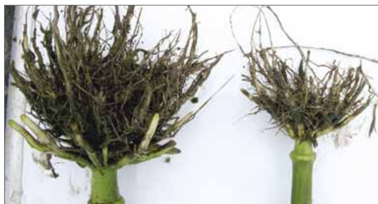
Force on Trait

A Force application over the top of rootworm-traited corn can provide the added protection growers need, leading to stronger, more developed root systems and healthier plants that are better prepared to fight off disease and increased stress levels, which ultimately leads to increased standability, a faster harvest and increased yields.