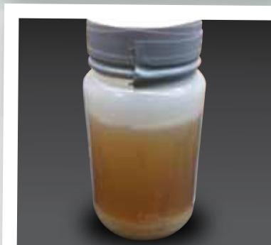
Bicep II Magnum

Note the suspension stability of Parallel Plus vs Bicep II Magnum. Time Lapse: 48 hours