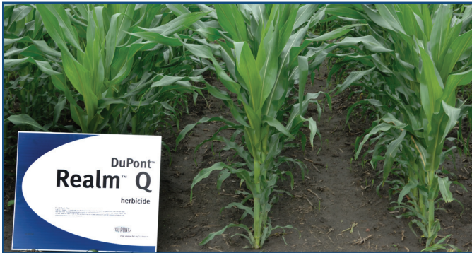
DuPont™ Prequel® 1.67 oz/A followed by Realm™ Q 4.0 oz/A + COC + AMS. Iowa State University, Ames, Iowa. Photo taken June 21, 2010.