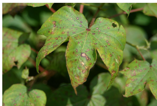
Stemphylium leaf spot