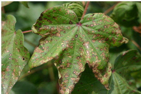
Alternaria Leaf Spot