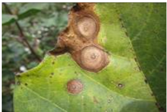
Corynespora leaf spot*