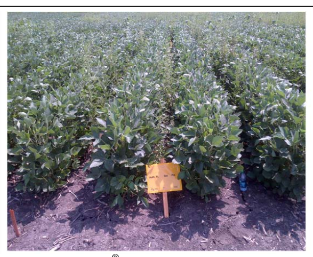
Authority® XL 5 oz/A 56+ DAT