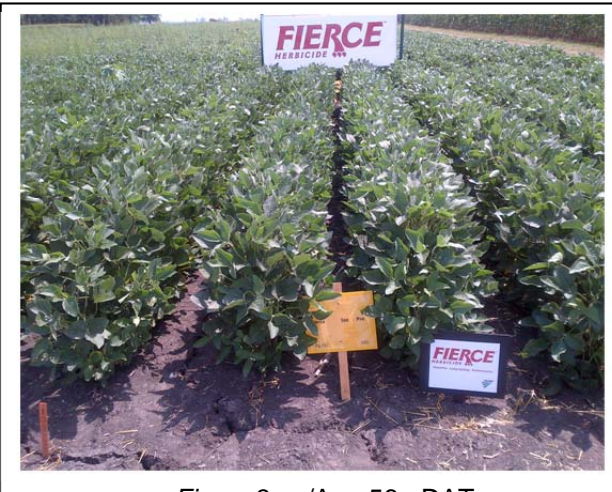
Fierce 3 oz/A 56+ DAT