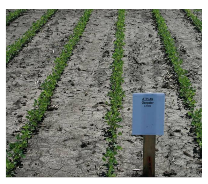
Gangster 2.4 oz/A