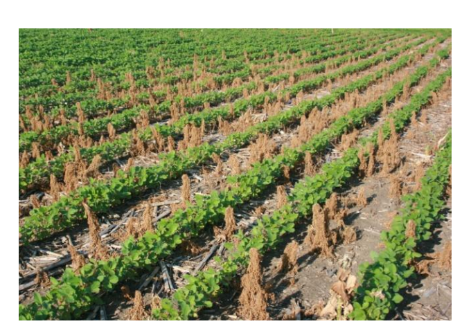
Resource + glyphosate - Lambsquarters