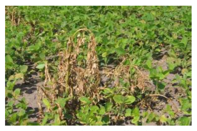
Resource + glyphosate - Waterhemp