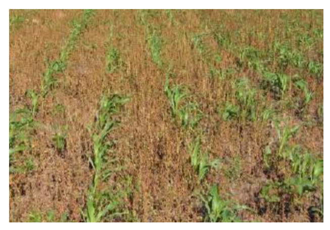
Resource + glyphosate - Lambsquarters