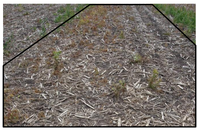
Resource + glyphosate burndown – Lambsquarters, Prickly Lettuce