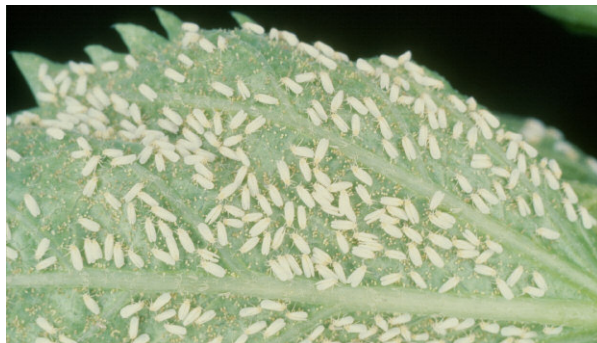
Silver Leaf Whitefly