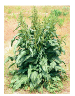
Curly Dock

A cost-effective alternative to Harmony® Extra herbicide, NIMBLE also has a low use rate and can be tank-mixed with other suitable herbicides to control additional weeds. NIMBLE may also be used for preplant burndown programs.