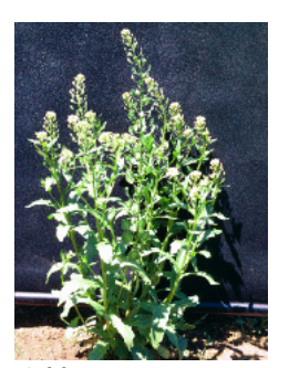
Field Pennycress