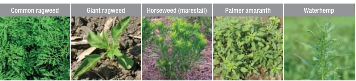
Visit weedscience.org for the most current list of glyphosate-resistant weeds. See Callisto product label for specific instructions related to these weeds.

Callisto adds another mode of action to glyphosate, which helps manage against weed resistance and delivers improved activity on broadleaf weeds not currently controlled by glyphosate alone.