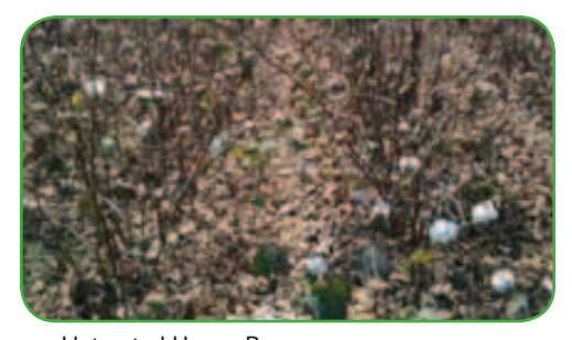
Untreated Heavy Pressure