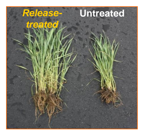
Enhanced Plant Growth Planted on Oct 20 Release treated wheat shows improved root and vegetative growth in April compared to untreated (five plants per treatment).

Release helps overcome poor germination and emergence by stimulating enzymes that convert stored starch into simple sugars. These sugars are the energy source required for proper germination and emergence. By conditioning seed with Release a uniform level of energy conversion can be obtained allowing for optimal seed performance.