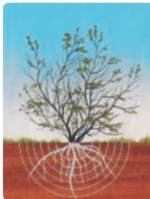
3. Brush defoliates and re-foliates over time until the food reserves in the roots are gone.