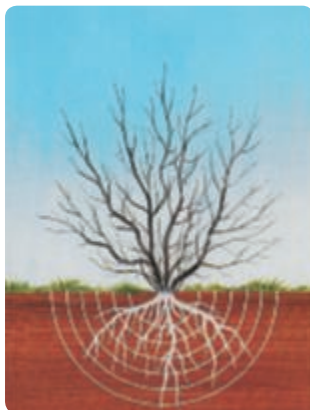
2. Brush defoliates.