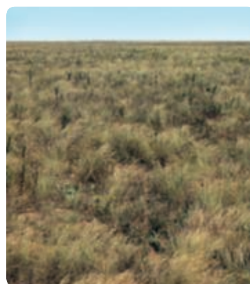
15 months later.