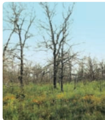
15 months later.