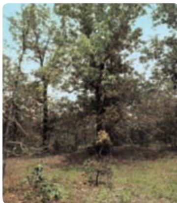
Fischer Ranch, Eufaula, Okla. Three months after application of Spike 20P.

So whether it's to sculpt the landscape or to manage brush long-term, years of proven effectiveness give land managers confidence when treating with Spike® 20P specialty herbicide.