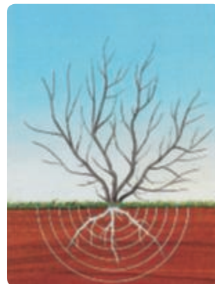
4. Brush is completely dead, roots and all.