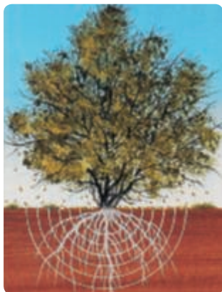
1. Spike 20P works from the roots up, translocating into leaves.