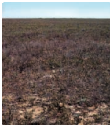
Beasley Ranch, Plains, Texas. Three months after application of Spike 20P.